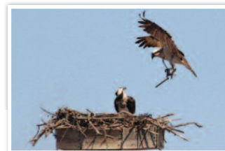
>>> Conrad Voels from People's Security installs new Osprey cam at Central Lakes College.

The online link is http://ospreycam.clcmn.edu/ .